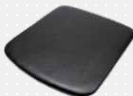
O seat/backrest when using special cushion