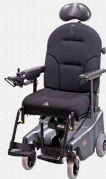
VELA Blues 100-SW