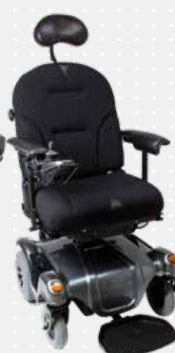
VELA Blues 300

THE MODULAR DESIGN ENABLES THE SEAT PAD & BACKREST TO BE CHANGED TO ACCOMMODATE GROWTH