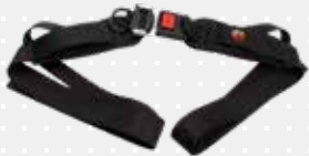
Y seat belt