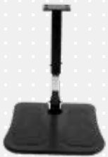
Footrest with fold-out LP plate