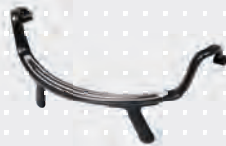
Fold-out foot bar