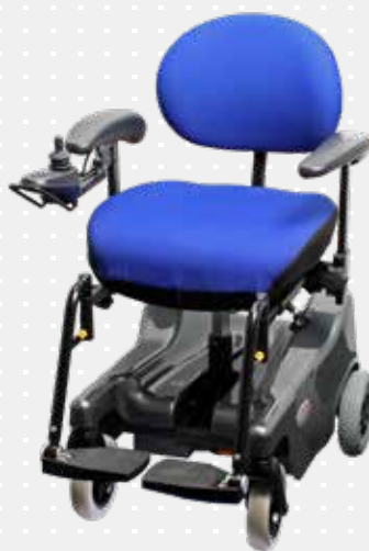
VELA Blues 100

COMPACT POWERCHAIR THAT IS EASY TO MANOUVRE AROUND THE OFFICE