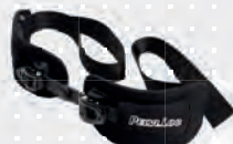
Pelvic four-point lap belt