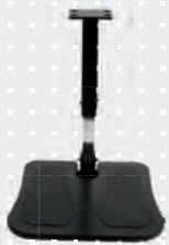
Footrest with fold-out LP plate