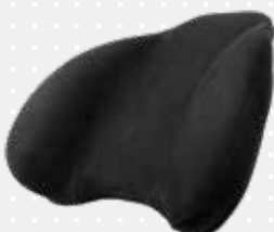
ES backrest with lateral support