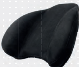
ES backrest with lateral support