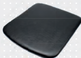
O seat/backrest when using special cushion