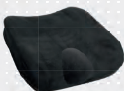
E seat with pommel