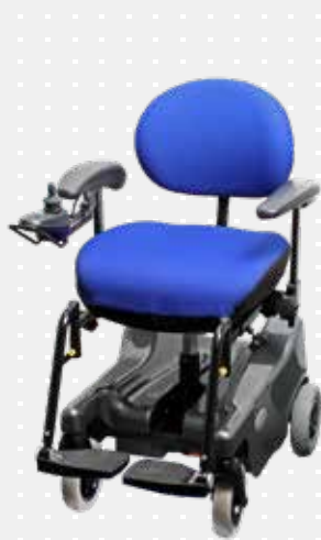
VELA Blues 100

VELA Blues - Powerchairs that 'grows' with the child