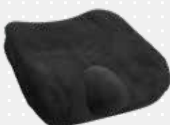
E seat with pommel