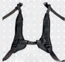
H seat belt