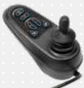
P & G VR2