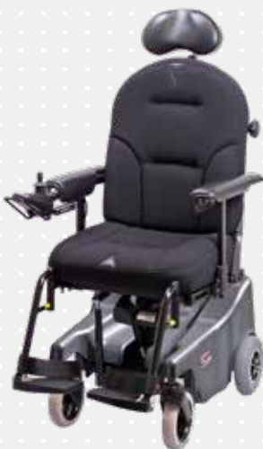
VELA Blues 100-SW