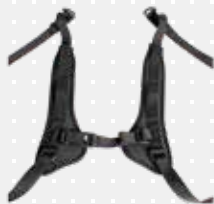
H seat belt