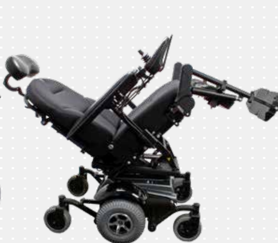
VELA Blues 210