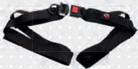
Y seat belt