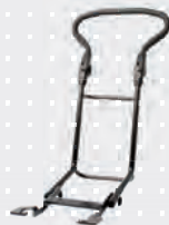
Multi-adjustable push bar